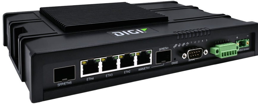
DIGI IX40 — FRONT