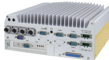
*R.O.C Patent No. M456527/ I598820